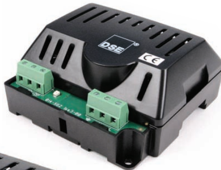
DSE9150 - 3 A 12 V