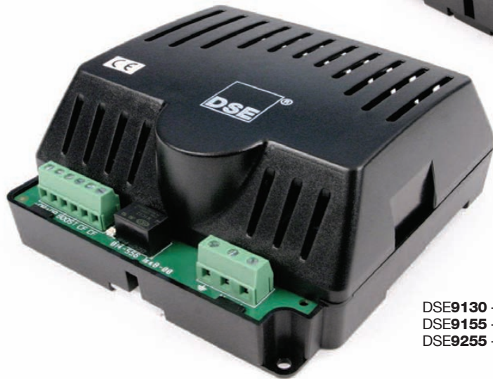
DSE9130 - 5 A 12 V DSE9155 - 2 A 30 V DSE9255 - 5 A 24 V